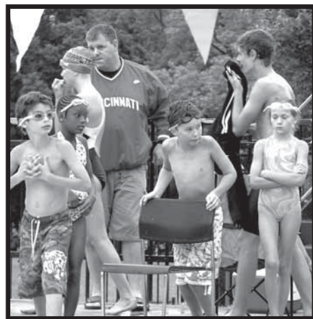
A school of Piranhas and parent volunteers at one of the Wednesday night meets at the Pleasant Ridge Pool.

Every week we walked away with new friends – both kids and parents. My son met a girl who would be in his new class at Pleasant Ridge Montessori, my daughter saw friends she knew from pre-school, we found a babysitter from the crop of older swimmers, and we began a collection of ribbons to show the swimming accomplishments.